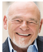
Sam Zell Chairman EQUITY GROUP INVESTMENTS (EGI)