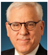
David Rubenstein Co-Founder and Co-Executive Chairman THE CARLYLE GROUP